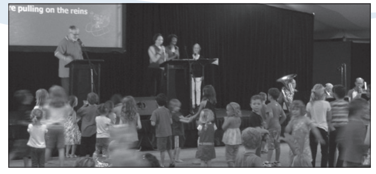
Over 500 families, friends and guests attended the carols.

Carols could be heard drifting across the rooftops of the Novotel Twin Waters Resort as over 500 local families, friends and guests enjoyed a night of festive cheer and the rain eventually stopped for the Fireworks at 8.00pm.